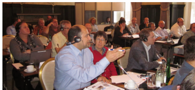
Photo: Participants of the EWC-Conference in London in October 2013